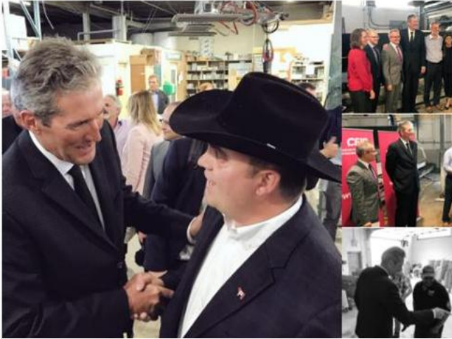
Premier Pallister stands with CFIB against federal tax changes

Proud to stand with Manitoba business owners and farm families to voice our concerns over the proposed federal tax changes #mbpoli #cdnpoli