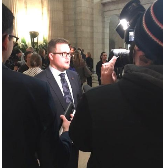
Raising concerns about a net tax increase in the 2018 budget