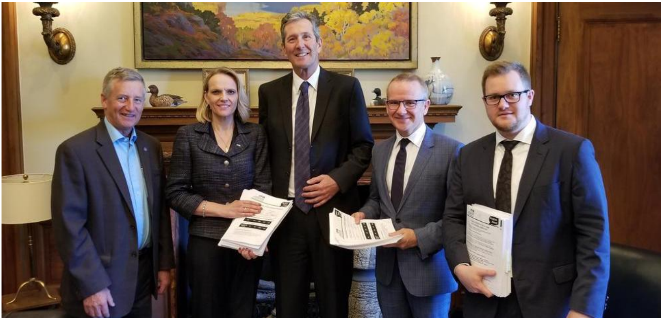
Delivered over 2,500 signed petitions to Premier Pallister and Minister Pedersen