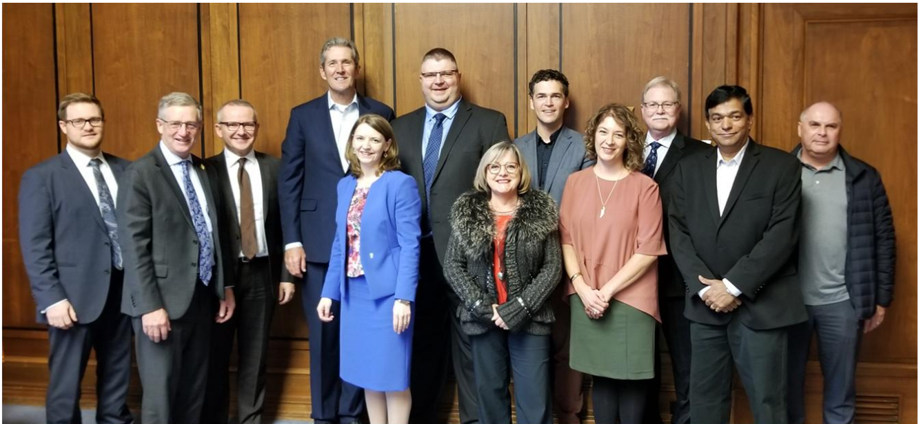
CFIB's Board of Governors discussing election commitments with Premier Pallister (4 th from left) and Minister Pedersen (2 nd from left) on October 22 nd , 2019