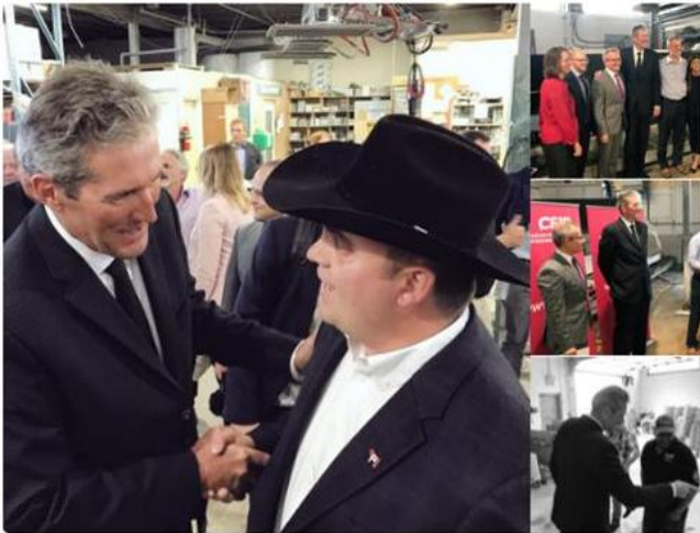
Premier Pallister stands with CFIB against federal tax changes