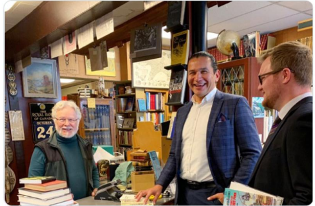
Working with all parties to make small business their big focus